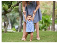
Developmental Milestones: Teacher, Teacher What Do You See (5)