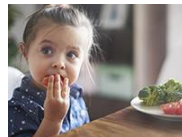
From Food to Physical Activity (4)