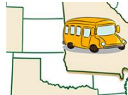
Transportation Training for Georgia (3)