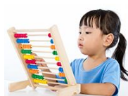
STEM in Preschool Classroom (5)