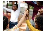
Creating Positive Connections (4)