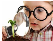
Foundations for Learning Every Day (3)