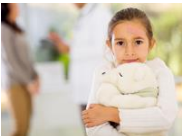
Safe Space & Places to Grow & Learn (3)