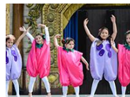
Inspiring Creativity: All the World is a Stage (4)