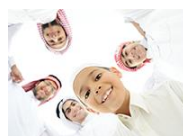
Honoring All Families (4)