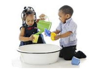
Foundations of Curriculum (4)