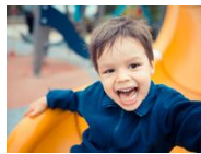
Piramide: Power of Play (3)