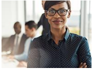
Administrative Leadership (3)