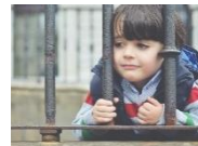
To Expel or Not to Expel (4)