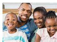
Family Engagement: Road to Better Outcomes for Children (4)