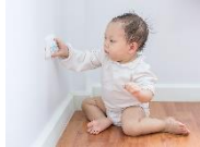
Keeping Our Children Safe: Planning Ahead & Being Prepared (4)