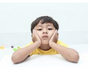
Challenging Behavior: Reveal the Meaning (3)