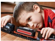
Autism 101 (3)