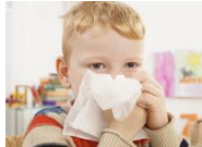
Cut the Cooties! Communicable Disease Prevention (2)