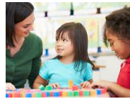
Teaching with Intention (4)