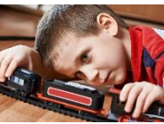
Autism 101 (3)