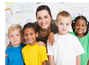
The Juggling Act: Schedules, Routines, Transitions (4)