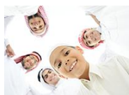
Honoring All Families (4)