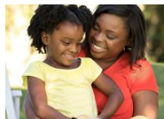
Building Positive Relationships (4)