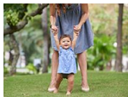
Developmental Milestones: Teacher, Teacher What Do You See (5)