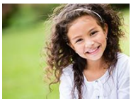
Child Assessment: The Essentials of Individualizing (4)