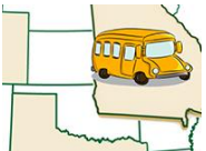
Transportation Training for Georgia (3)