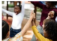
Creating Positive Connections (4)