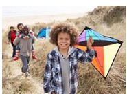
Building Strong Relationships with Families (3)