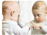
Learning Every Day Through the Senses (2)