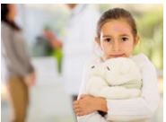
Safe Space & Places to Grow & Learn (3)