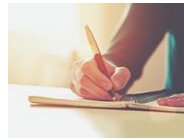
The Reflective Teacher (3)