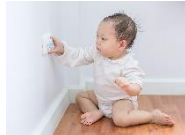
Keeping Our Children Safe: Planning Ahead & Being Prepared (4)