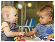
CDA Planner (5)