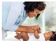
Responsive Caregiving: Nurturing Caregiving Infants and Toddlers (2)