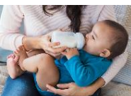
Responsive Feeding for Infants & Young Toddlers (2)