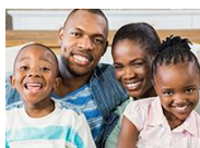
Family Engagement: Road to Better Outcomes for Children (4)