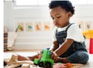
Enriching Indoor Environments (5)