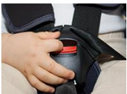
Traveling with Precious Cargo (3)