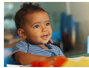
The Developing Infant & Toddler (3)