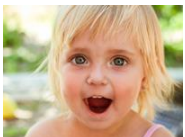
Child Language Development and Signs of Delay (3)