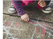
Outdoor Learning Environment (4)