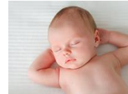
Safe Sleep & Sweet Dreams for Infants (2)