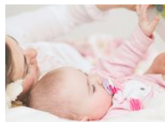
Growing Language for Infants & Toddlers (3)