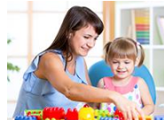
Learning Environment (4)