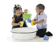
Foundations of Curriculum (4)