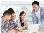
Essentials of Leadership in ECE (4)