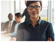
Administrative Leadership (3)