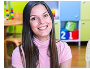
Program & Classroom Assessment (3)