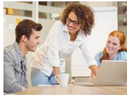
Principles of Quality Teams (4)